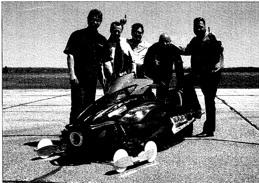
The Gagne Lessard Team from Coaticook, Quebec will be attempting a land speed record for snowmobiles this fall. The stock bodied Yamaha (pictured above) recently attained a top speed of 179.2mph, however, a new streamliner with a custom shell hopes to exceed the magic 200mph barrier at Bonneville.